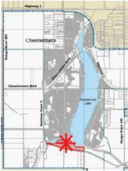
* SUBJECT SITE