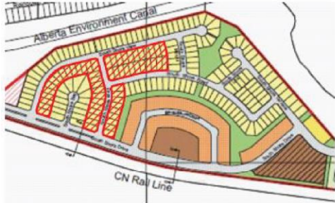
■ SUBJECT LANDS